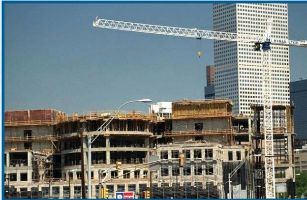
Canada's code development system promotes uniformity in building construction across the country.

Under the British North America Act and its successor, the Constitution Act, responsibility for building regulation in Canada rests with the provinces and territories. This responsibility was generally delegated to municipalities, which, not surprisingly, resulted in a multiplicity of regulations being developed over time as each municipality tried to deal with its own needs. These variations from one municipality to the next made it very difficult for designers, product manufacturers and contractors to conduct business in more than one region. It was also very difficult for national programs supporting housing and other construction work to be implemented. Thus, in 1937, the federal Department of Finance asked the NRC to develop a model building regulation that could be adopted by all municipalities in Canada. The result of that initiative was the publication of the first edition of the NBC in 1941.