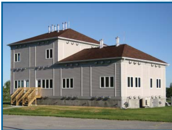
Future sensing includes keeping tabs on leading research that may have code implications, by facilities such as the NRC Indoor Air Research Laboratory.

objectives. The action plans address four near-term priorities: communications and marketing, timeliness and responsiveness to change, harmonization of provincial/territorial and national codes, and sensing of emerging issues.